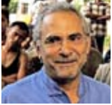
DR JOSE RAMOS-HORTA HE, The President of Timor-Leste